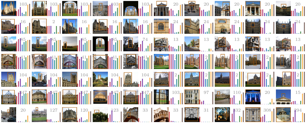
Figure 6. Performance (AP) per query on \mathcal{R}Oxford + \mathcal{R}1M with Medium setup. AP is shown with a bar for 8 methods. The methods, from left to right, are HesAff-rSIFT-ASMK*+SP , DELF-ASMK*+SP , DELF-HQE+SP , V-[O]-R-MAC , R-[O]-GeM , R-[37]-GeM , R-[37]-GeM+DFS , HesAff-rSIFT-ASMK*+SP \rightarrow R-[37]-GeM+DFS . The total number of easy and hard images is printed on each histogram. Best viewed in color.