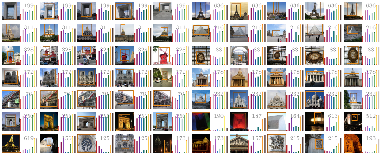
Figure 7. Performance (AP) per query on \mathcal{R}Paris + \mathcal{R}1M with Medium setup. AP is shown with a bar for 8 methods. The methods, from left to right, are HesAff-rSIFT-ASMK*+SP , DELF-ASMK*+SP , DELF-HQE+SP , V-[O]-R-MAC , R-[O]-GeM , R-[37]-GeM , R-[37]-GeM+DFS , HesAff-rSIFT-ASMK*+SP \rightarrow R-[37]-GeM+DFS . The total number of easy and hard images is printed on each histogram. Best viewed in color.

sion performs similarity propagation by starting from the query’s nearest neighbors according to the CNN global descriptor. This inevitably includes false positives, especially in the case of few relevant images. On the other hand, local features, e.g. with ASMK*+SP , offer a verified list of relevant images. Starting the diffusion process from geometrically verified images obtained by BoW methods combines the benefits of the two worlds. This combined approach, shown at the bottom part of Table 5, improves the performance and supports the message that both worlds have their own benefits. Of course this experiment is expensive and we perform it to merely show a possible direction to improve CNN global descriptors. There are more methods that combine CNNs and local features [53], but we focus on the results related to methods included in our evaluation.