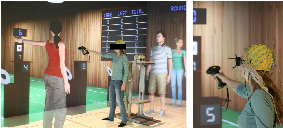
FIGURE 1 | Experimental Setup. (Left) Subjects were standing in the immersive projection system and were able to interact with the system using an ART Flystick. (Right) Subjects were wearing a high-density 64 channels EEG cap.