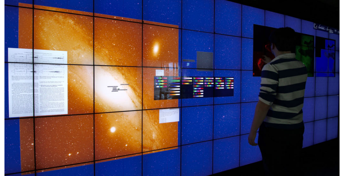
Figure 2. FITS-OW on WILDER showing multiple FITS images, the result-set of a SIMBAD query restricted to observations about galaxies, basic measurements for galaxy M31, a page of a research paper discussing that particular galaxy, and the color map selector.

Astronomers perform these operations using interaction techniques that were designed specifically for wall displays, using direct manipulation and gestures performed on the wall's surface or on handheld tablets 8 . Details about the specific challenges addressed in FITS-OW are discussed in our upcoming SPIE Astronomical Telescopes and Instrumentation conference paper 7 : generation of FITS tile pyramids and their multi-scale rendering; queries to sky catalogs; dynamic adjustment of scale, color mapping and graphics compositing settings, and the underlying input management framework.