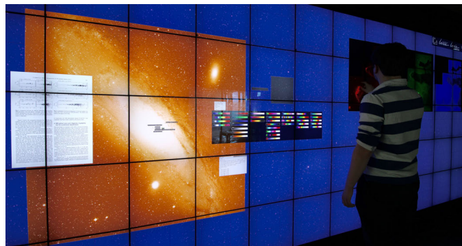
Figure 2. FITS-OW on WILDER showing multiple FITS images, the result-set of a SIMBAD query restricted to observations about galaxies, basic measurements for galaxy M31, a page of a research paper discussing that particular galaxy, and the color map selector.