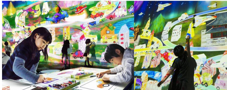
Figure 12. Sketch Town, Co-Creation Art, Team lab, Japan, 2017[15]

Chinese artists Play with their Audience. The work "Life · Hair" (Figure13) was created by students at China Central Academy of Fine Arts. The main material is embroidered women's hair on silk. Artist uses technology (the principle of static electricity) to let the audience feel the delicate emotion of women through their touch. For technical solutions, the artist collaborated with students majoring in nuclear physics at the Tsinghua University. So, the artist calls it a cross-border art.