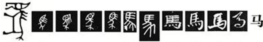
Figure 8. Examples of transformation of Chinese characters “Horse” over time [9]