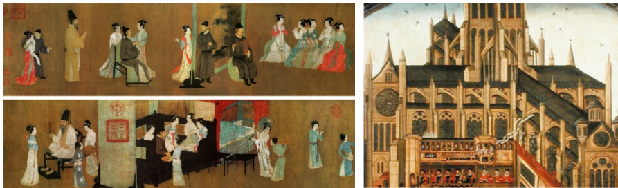
Figure 9 and 10. Han Xizai Evening Banquet, China, 937-975 AD [10]; John Gipkin, Bishop King Preaching at Paul's Cross before King James I. (1616) [13].

New developments in artistic techniques allowed, and triggered, active behavior of the audience: horizontal Chinese scrolls require the viewer to walk the painting from the start of a story to the end. (Figure 9).