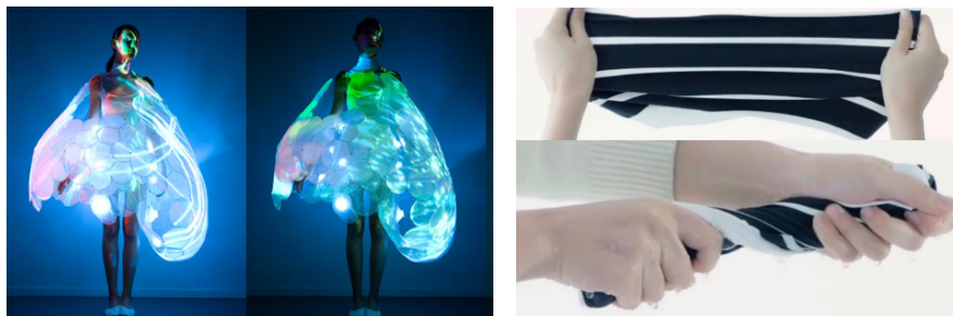
Figure 15 and 16. Bubelle Emotion Sensing Dress. Design group at Royal Philips Electronics, Netherlands. 2007 [19]; Fabric Strain Sensor, AdvanPro. Hong Kong [20]

Wearable Art - Interactive Textiles. Wearable devices are not just a hardware device supported through software, data exchange, and online interaction [18]. Wearable devices may have powerful effect on our perception of life. Smart fabric in wearable devices is a very representative case. The trend is to make core computing modules smaller (to nanoscale units), and they are increasingly being used by artists. Philips Design gave (in 2007!) a glimpse of how will fashion look in 2020(Figure15): The Bubelle Dress changes its look instantaneously according to wearer emotional state. It is made up of two layers, the inner layer contains biometric sensors that pick up a person's emotions and projects them in colors on the second layer, the outer textile, though limited to the sensor module and bulky looks [19].