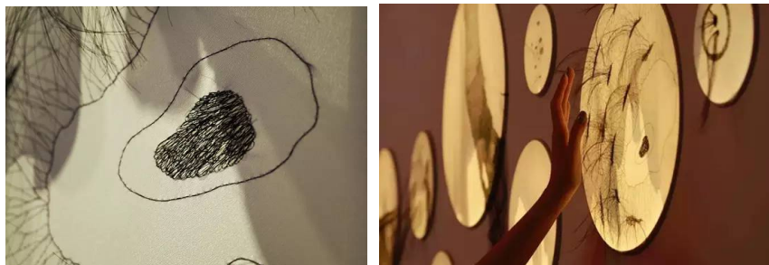
Figure 13. Life - two scenes from Hair, Interactive Art, Chen Yu, Beijing, 2016[16]

Chinese artists Play with their Audience. The work "Life · Hair" (Figure13) was created by students at China Central Academy of Fine Arts. The main material is embroidered women's hair on silk. Artist uses technology (the principle of static electricity) to let the audience feel the delicate emotion of women through their touch. For technical solutions, the artist collaborated with students majoring in nuclear physics at the Tsinghua University. So, the artist calls it a cross-border art.