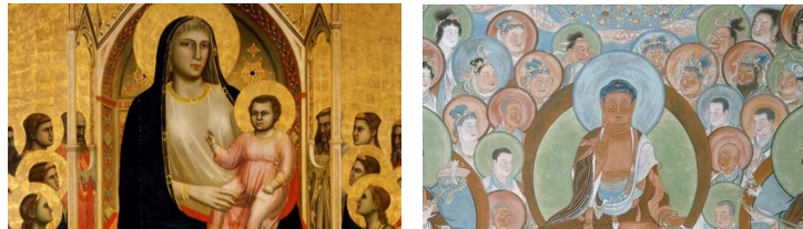
Figure 5 and 6. Halos of Christian gods (Giotto di Bondone: Ognissanti Madonna. Italy. c. 1310) and Buddhist gods (Dunhuang Mural. China. ca. 538 AD). [6][7]

ence in rank. This style shows many expressive techniques in painting and sculpture, representing the meaning as well as the specific style and workmanship, which is related to a specific period. These characteristics often are used as the basis for dating.