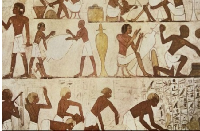
Figure 3. Egyptian mural. ca. 1100 B.C. [4].