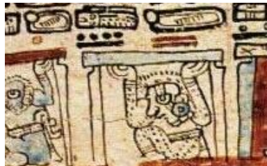
Figure 7 Mayan text, Around the Christian era. [8]

In a next stage of civilizations, series of images were used to represent spoken language, where the individual images were supposed to be named and the string of names was supposed to (actively) be interpreted by the audience as a spoken sentence.