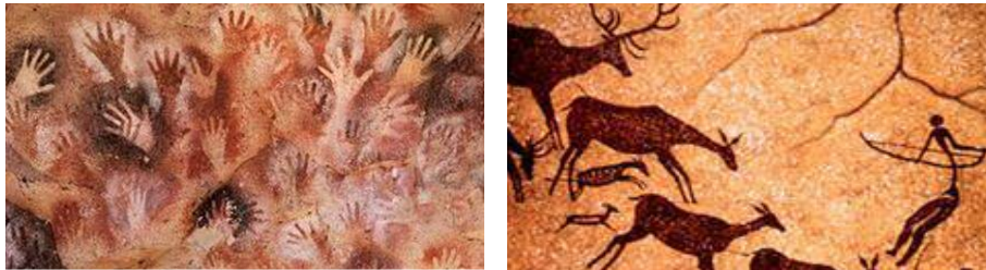
Figure 1 and 2. Lascaux Cave Paintings, France, Lascaux, ca 17000 BC [3]

Prehistoric cave- or rock paintings represent the earliest forms of painting that survived, traced back to 40 thousand years ago. We experience a hint of the spiritual life of our ancestors, and we may imagine the intended audience (members of the same tribe, gods), who were supposed to (actively) interpret and understand the message as depicted. Figure 1 shows how the artist triggers his audience to see a depicted hand, where “she” (According to archaeologists, these are feminine handprints.) in fact, paints the space around the (invisible) hand – the audience will “fill in” the invisible. The deer in Figure 2 may well represent something related to hunt, and tribal relatives of the artist will have known much more about the values, activities, and emotions related to the scene than modern viewers will ever be able to understand.