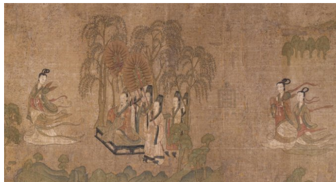
Figure 4. Painting of the ode of the River Goddess, Gu Kaizhi, A.D. 348 – 409 [5].

Ancient Egyptian murals are characterized by realism combined with deformation and decoration; hieroglyphs and images are used together, and the artist always maintains the readability (Figure 3). The picture composition is arranged with characters in a line, with different sizes according to the status hierarchy and carefully represented distances to get the image size in order. Other than this, there is a stylized regularity and unity in the form of expression, and some artistic techniques have been used continuously over many centuries to form a unique style of Egyptian art. The intended audience, whether human or god, will have understood the emotional intentions and the esthetics in relation to their interpretation of the meaning.