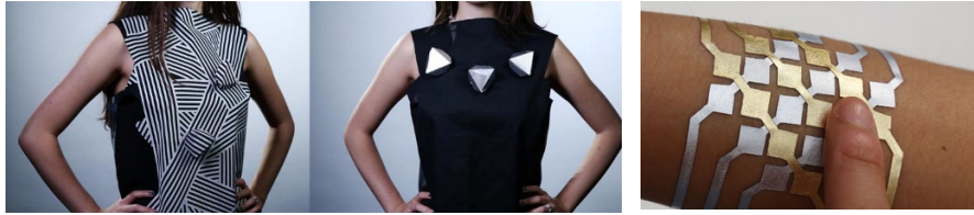
Figure 17 and 18. Kino project of MIT media lab: Pattern Changing & Shape-changing jewelry. USA. 2017[22]; MIT's Duo Skin, USA. 2016[23]