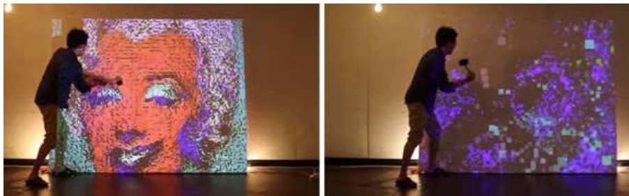
Figure 11. Breaking Andy Wall, Interactive Art, Leo Kang

Experiences in the different contexts. From our analysis of museums, galleries, and international conferences we detect an amazing jump in the impact of technology on art. We will discuss some examples from the art exhibition at CHI 2016, San Jose: 'Breaking Andy Wall' (Figure11) is an interactive installation. When participants smash the canvas with the hammer, they can gradually break down the art piece. Through the playful destruction and reconfiguration of iconic art pieces, this installation reconfigures relations between art objects and their audiences [14].