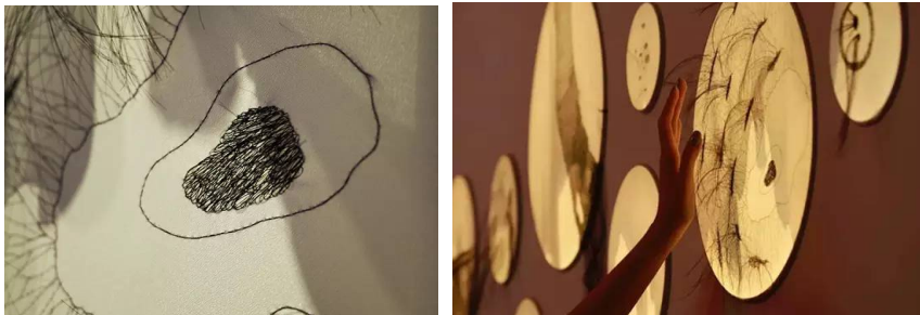
Figure 13. Life - two scenes from Hair, Interactive Art, Chen Yu, Beijing, 2016[16]

Chinese artists Play with their Audience. The work "Life · Hair" (Figure13) was created by students at China Central Academy of Fine Arts. The main material is embroidered women's hair on silk. Artist uses technology (the principle of static electricity) to let the audience feel the delicate emotion of women through their touch. For technical solutions, the artist collaborated with students majoring in nuclear physics at the Tsinghua University. So, the artist calls it a cross-border art.