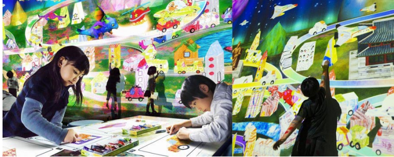
Figure 12. Sketch Town, Co-Creation Art, Team lab, Japan, 2017[15]

Chinese artists Play with their Audience. The work "Life · Hair" (Figure13) was created by students at China Central Academy of Fine Arts. The main material is embroidered women's hair on silk. Artist uses technology (the principle of static electricity) to let the audience feel the delicate emotion of women through their touch. For technical solutions, the artist collaborated with students majoring in nuclear physics at the Tsinghua University. So, the artist calls it a cross-border art.