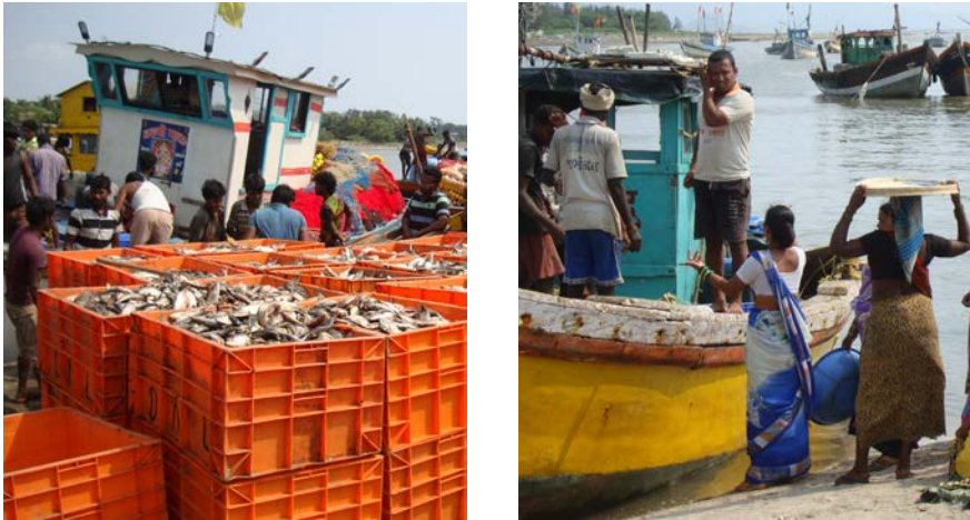
Fig. 1. Fisheries landing center in Alibaug village.

In coastal Indian villages fishing provides jobs and income for nearly a million fishers and even more people in the processing and marketing of the landed fish. To support the fishers in the Maharashtra state an app for mobile phones has been developed in a decade-long collaboration between Tata Consultancy Services (TCS), Innovation Lab Mumbai, Central Marine Fisheries Research Institute (CMFRI), Indian National Center for Ocean Information Services (INCOIS), Indian Council of Agricultural Research (ICAR), and local fishery societies. Maharashtra has a coastline from Mumbai in the north and 720 kilometers southward. One of the fishery villages along the coastline is Alibaug (Fig. 1), which we visited in September 2017.