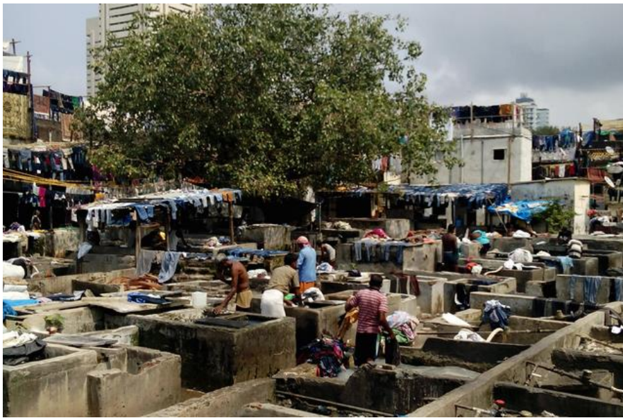
Fig. 1. Washing men at work in Mumbai

machine by 2010 [6]. To prevent accidental water flooding, it is mandatory to push a button to release an electromagnetic door lock before the washing machine door will open. Washing machines enter such a state at the end of the washing program and usually signal this only visually. Lack of sight makes it hard to know why the door will not open when this visual indicator is not present. Some machines do include an auditory signal, but there is only one auditory signal (a generic beep), which sounds when the washing program begins, when there is a problem and when the program ends. Although a visually impaired user can hear the signal, it is not sufficiently communicative to understand what state the washing machine is in.