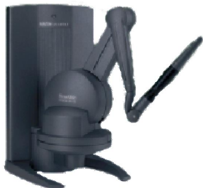
Figure 2: PHANToM haptic device

In these experiments the user will use a PHANToM Desktop haptic device (figure 2). The force is exerted on a stylus the users hold in the hand. This version of the device has six degrees of freedom (three in translation and three in rotation), and renders forces on the three translation ones.