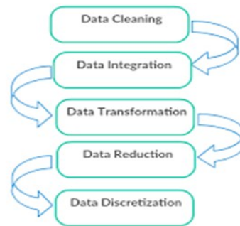
Figure 1. Data Preprocessing techniques

lacking certain attributes of interest, or containing only aggregate data), noisy (containing errors or outliers), inconsistent (containing discrepancies in codes or names) and contain redundancies, is not directly applicable for a starting a data mining process. We must also mention the fast growing of data generation rates and their size in business, industrial, academic and science applications. The bigger amounts of data collected require more sophisticated mechanisms to analyze it. Data preprocessing is able to adapt the data to the requirements posed by each data mining algorithm, enabling to process data that would be unfeasible otherwise. Data preprocessing mainly includes: