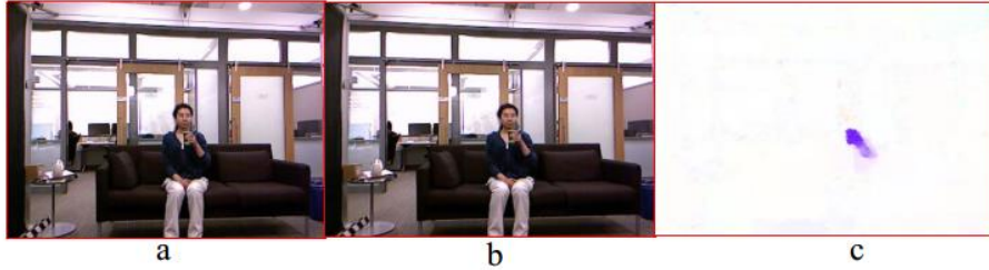
Fig. 2. Illustration of optical flow in human actions. (a) and (b) show a pair of successive video frames with human body motion. (c) shows the motion area.