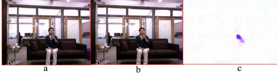
Fig. 2. Illustration of optical flow in human actions. (a) and (b) show a pair of successive video frames with human body motion. (c) shows the motion area.