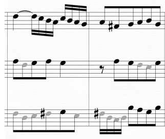
Figure 8. J.S. Bach: fugue No.6 of “The Well-Tempered Clavier” (BWV 851).