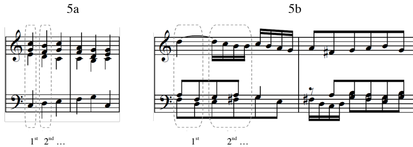
Figure 5. Subdivision of the scores into movements.

To separate the voices of a score starting from a musical input, the sounds must be, first of all, divided into movements, according to the beat of the composition (figure 5a), thus obtaining chords (i.e. the simultaneous overlapping of several sounds). Bear in mind that every voice may be even made up by several sounds within the same movement (figure 5b). The assignment of the notes to the various voices is therefore performed in chronological order, from the left to the right, beginning with the first movement: every note of the first movement is considered in itself as sound of a voice.