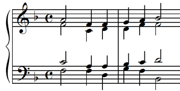
Figure 1. Polyphonic composition

In case of a polyphonic composition (figure 1), which entails a simultaneous ensemble of several voices on several pitches and in parallel or opposite directions, data (sound) reading and their proper assignment to a certain voice rather than to another voice becomes vital: both in case of the analysis of the musical text and in case of the information retrieval by the search engine.