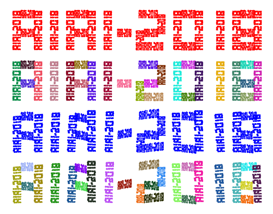
Fig. 3. Example of the AIAI-2018 fractal (from top to bottom): original image in red, original image with different colors for each contractive function, reconstructed image in blue, and reconstructed image with different colors for each contractive function.