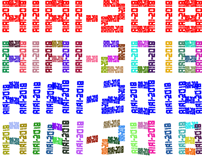
Fig. 3. Example of the AIAI-2018 fractal (from top to bottom): original image in red, original image with different colors for each contractive function, reconstructed image in blue, and reconstructed image with different colors for each contractive function.