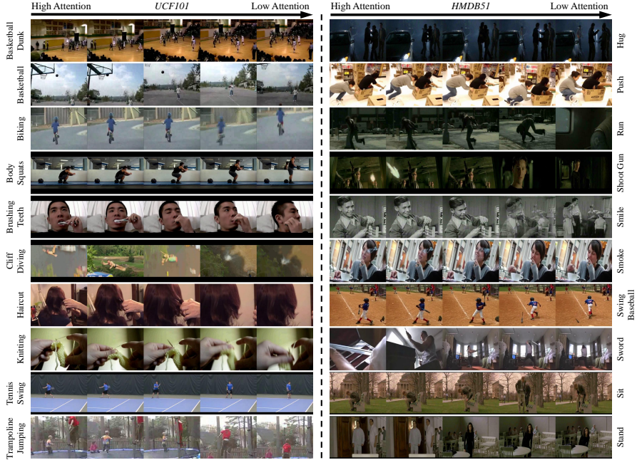
Fig. 3. Some example frames sorted by their attention weights from high (left) to low (right) along with their action category labels. The frames of the left part are from the UCF-101 dataset, and the frame of the right part are from the HMDB-51 dataset. We can see that the representative frames are assigned with higher attention weights compared with frames in poor conditions, such as motion blur ( e.g. , Biking and Knitting), shot changing ( e.g. , Smile), irrelevant clips ( e.g. , Shoot Gun and Run), partial observation ( e.g. , Brushing Teeth and Haircut), and semantic ambiguity ( e.g. , Tennis Swing and Hug).

attention module can automatically pay more attention to the representative frames while suppressing the frames in poor condition, without providing any extra supervision during training. For example, in video “Hug”, it is difficult to judge it is either hugging or hand shaking by the frames with low attention. However, the frames with higher attention can clearly reveal the hugging action. Similar examples can be found in other videos shown in Fig. 3.