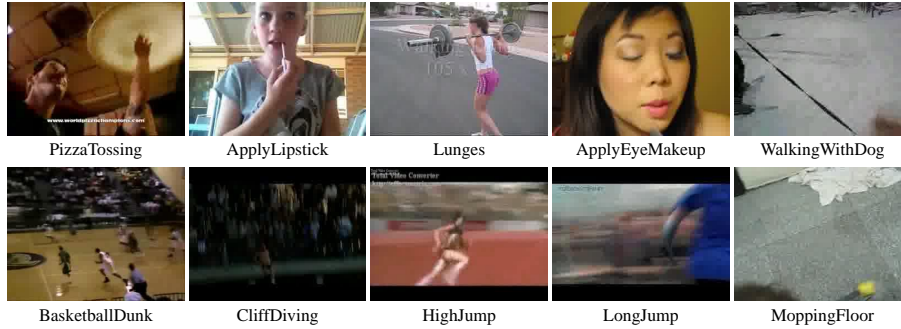
Fig. 1. Some example frames along with their action category labels that are not suited for the action recognition task. In these cases, it is very difficult to predict the video category by a single frame. The first row consists of frames with semantic ambiguity, which can be easily mistaken for PlayingDaf, BrushingTeeth, CleanAndJerk, ApplyLipstick and Skiing from left to right. The second row consists of frames in poor condition, such as motion blur and poor illumination.

methods, such as Fisher Vectors [16], to aggregate local hand-crafted descriptors into a global video representation [4]. With the benefit from the deep CNN, early CNN based methods propose to use a single frame to represent the whole video [6], or feed multiple frames into CNN and aggregate them with average or max pooling strategy [18, 9]. In addition, [19] proposed to employ a long short-term memory (LSTM) network upon the CNN, which can model the temporal correlations among frames into a fixed-length representation. To further explore both the spatial and temporal correlations among video frames simultaneously, [20] first proposed the 3D convolution pipeline to handle related tasks in videos.