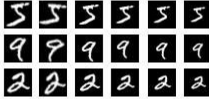
Fig. 2. Part of the New MNIST test images

Because of the MNIST data have relatively simple characteristics. Here divide the MNIST test set into six parts randomly, each part is transformed into different scales or angles, and then normalize the images in 28*28 pixels to get a new test set. The training set remains the same. Test on data sets MNIST, New MNIST.