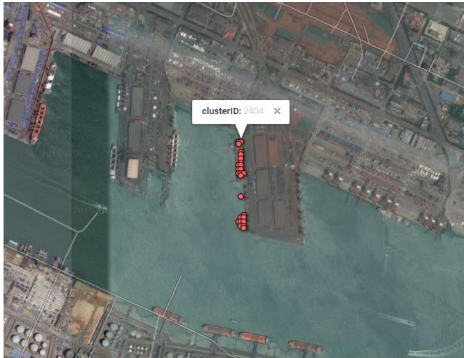
Fig. 3. A clusters of mooring points, belonging to a berth

We have mined ships' mooring positions base on AIS data, including position, speed and status. Each position was represented as a grid of 0.6 second longitude by 0.6 second latitude, and the membership that each grid belonged to a berth was calculated separately according to tracks located in this grid using fuzzy inference. After that, we clustered mooring positions into berths using DBSCAN, taking multiple attributes of positions into consideration in the function of distance. An example of a clustered berth is demonstrated in Fig. 3.