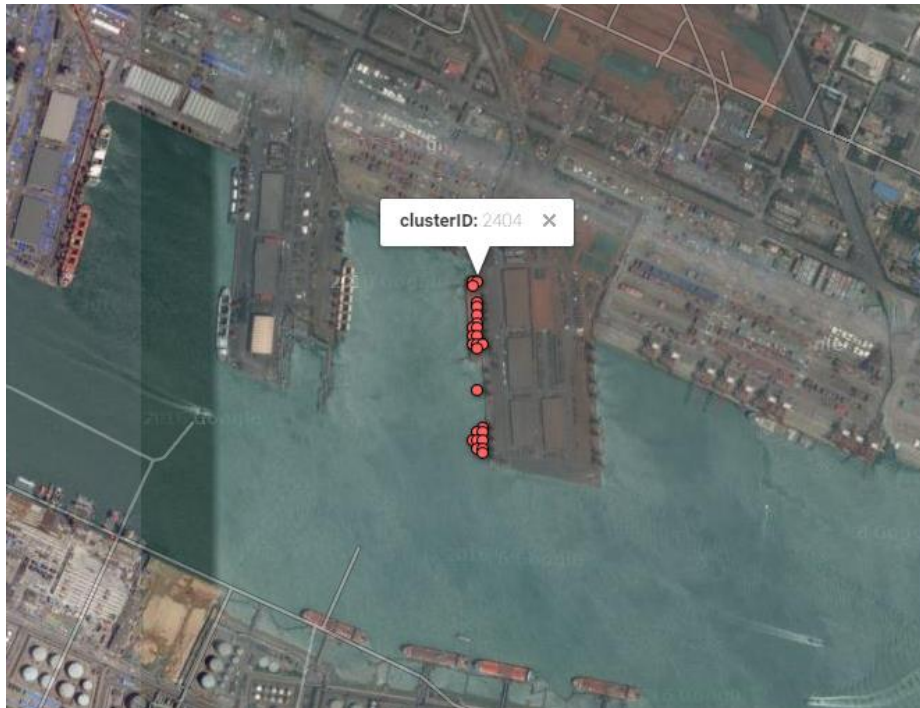
Fig. 3. A clusters of mooring points, belonging to a berth

We have mined ships' mooring positions base on AIS data, including position, speed and status. Each position was represented as a grid of 0.6 second longitude by 0.6 second latitude, and the membership that each grid belonged to a berth was calculated separately according to tracks located in this grid using fuzzy inference. After that, we clustered mooring positions into berths using DBSCAN, taking multiple attributes of positions into consideration in the function of distance. An example of a clustered berth is demonstrated in Fig. 3.