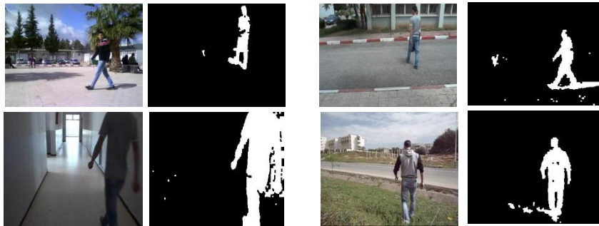
Fig. 2. Background subtraction results in personnel video database in both indoor and outdoor environments