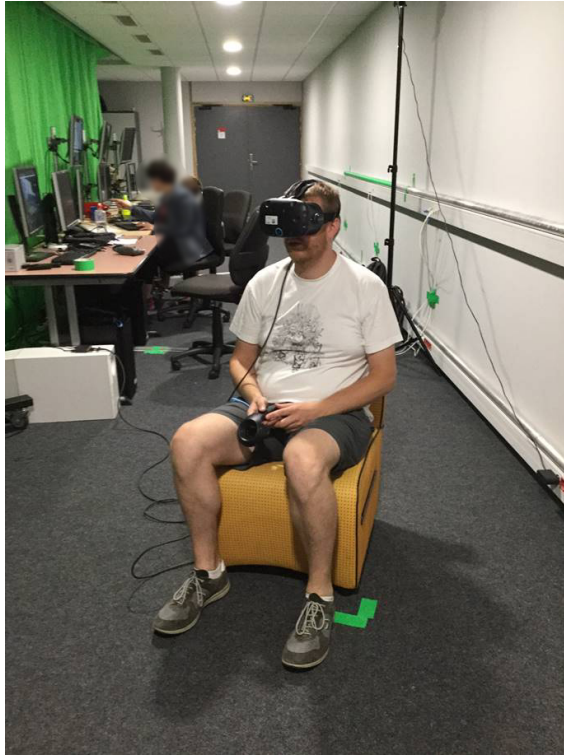
Figure 5: Subject during the experiment. He is wearing the virtual reality headset while sitting in an armless seat. An experimenter is reporting “ stop ” answers when the subject expresses discomfort with the pedestrian(s) passing by the car.

distance procedure. The “ stop ” answers were written down by an external reporter for each subject with their matching scenario as “1” (respectively as “0” when nothing was said). The percentage of “ stop ” answers was measured for each condition.