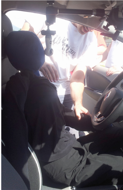
Figure 3: Installation of the soft dummy and the 360° camera within the autonomous car.