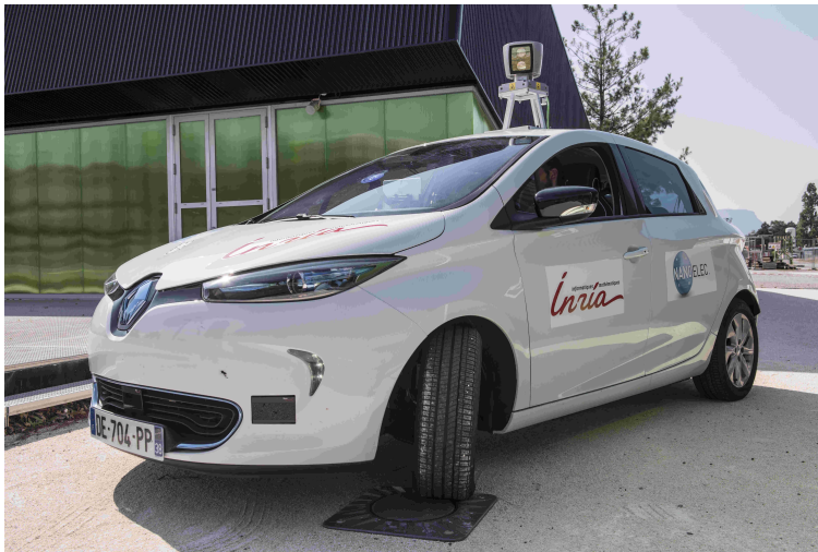
Figure 2: The autonomous electric car used in our experiment is a Renault Zoe. It is equipped with a Velodyne HDL64, 4 Ibeo Lux LiDARs, Xsens GPS and IMU, a stereo and 2 IDS cameras.

For the experiments, a Renault Zoe electric car has been equipped with a Velodyne HDL64 on the top, 3 Ibeo Lux LiDARs on the front and 1 on the back, Xsens GPS and IMU providing vehicle velocity and orientation, a stereo camera and 2 IDS cameras. Data from LiDARS are synchronized using ROS and fused into occupation grids [24]. The perception system is implemented on a PC in the trunk of the car equipped with a NVidia Titan X GPU, while the previously described automation process has been integrated in the vehicle. The control of the vehicle is implemented in a wired kit using BUS-CAN and direct control on the power steering. For the sake of the experiments, a dedicated portion of road has been designed and equipped with sensors and security requirements (PTL platform of IRT Nanoelec).