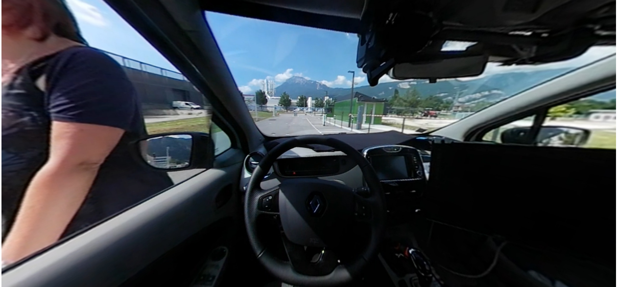
Figure 1: Example of a pedestrian passing by the car. The screen shoot is extracted from the 360° video as seen by subjects in the virtual reality headset. On this image, the pedestrian is on the left at 0.2m from the car. On top, one can see the camera mounted on the ceiling. On bottom right, the screen of the control computer of the autonomous car (off to avoid distraction).

Our experiment aims at testing whether a driven individual inside an autonomous car still has, in the absence, thus, of control over the car, a mental representation of a comfort space surrounding the car. In other words, we tested if the subject’s representation of the zone to defend around him extended its boundaries from his body to the car’s bodywork when being inside an autonomous car. In order to do so, we selected the factors which were likely to provoke the subject’s feeling of discomfort characteristic of an intrusion in the comfort zone, such as Hayduk defines it in [2]. The factors that we controlled were the ones which were likely to test something different from what we were testing, such as the risk of collision and the speed of the pedestrian tested in [11, 12]. They were all the factors linked with taking decisions related to the navigation of the car, directly dependent on the control over the car. Therefore, we eliminated the subject’s control over the car by virtually boarding them into an autonomous car using a virtual reality (VR) headset and by fixing the car’s direction. Regarding the pedestrian, still within a posture to avoid testing the calculation of a risk of collision, we fixed the pedestrian’s direction and his speed, and we eliminated any kind of communication from the pedestrian. Pedestrian was walking past the car in the opposite direction, without colliding with the car (figures 1 and 4).