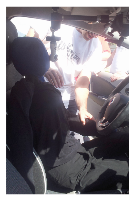
Figure 3: Installation of the soft dummy and the 360° camera within the autonomous car.