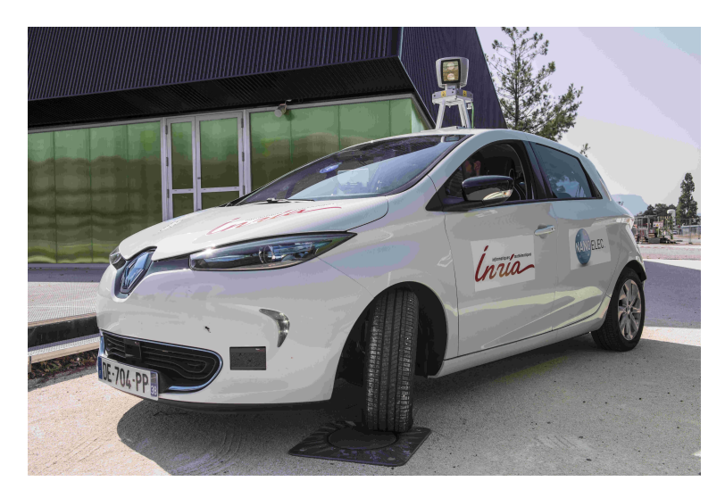
Figure 2: The autonomous electric car used in our experiment is a Renault Zoe. It is equipped with a Velodyne HDL64, 4 Ibeo Lux LiDARs, Xsens GPS and IMU, a stereo and 2 IDS cameras.

For the experiments, a Renault Zoe electric car has been equipped with a Velodyne HDL64 on the top, 3 Ibeo Lux LiDARs on the front and 1 on the back, Xsens GPS and IMU providing vehicle velocity and orientation, a stereo camera and 2 IDS cameras. Data from LiDARS are synchronized using ROS and fused into occupation grids [24]. The perception system is implemented on a PC in the trunk of the car equipped with a NVidia Titan X GPU, while the previously described automation process has been integrated in the vehicle. The control of the vehicle is implemented in a wired kit using BUS-CAN and direct control on the power steering. For the sake of the experiments, a dedicated portion of road has been designed and equipped with sensors and security requirements (PTL platform of IRT Nanoelec).