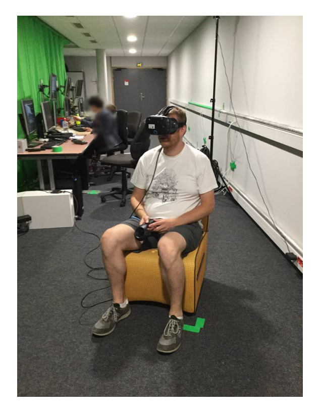
Figure 5: Subject during the experiment. He is wearing the virtual reality headset while sitting in an armless seat. An experimenter is reporting " stop " answers when the subject expresses discomfort with the pedestrian(s) passing by the car.

distance procedure. The " stop " answers were written down by an external reporter for each subject with their matching scenario as "1" (respectively as "0" when nothing was said). The percentage of " stop " answers was measured for each condition.