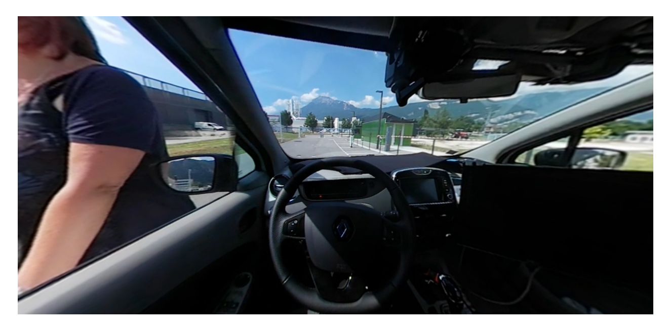
Figure 1: Example of a pedestrian passing by the car. The screen shoot is extracted from the 360° video as seen by subjects in the virtual reality headset. On this image, the pedestrian is on the left at 0.2m from the car. On top, one can see the camera mounted on the ceiling. On bottom right, the screen of the control computer of the autonomous car (off to avoid distraction).

Our experiment aims at testing whether a driven individual inside an autonomous car still has, in the absence, thus, of control over the car, a mental representation of a comfort space surrounding the car. In other words, we tested if the subject's representation of the zone to defend around him extended its boundaries from his body to the car's bodywork when being inside an autonomous car. In order to do so, we selected the factors which were likely to provoke the subject's feeling of discomfort characteristic of an intrusion in the comfort zone, such as Hayduk defines it in [2]. The factors that we controlled were the ones which were likely to test something different from what we were testing, such as the risk of collision and the speed of the pedestrian tested in [11, 12]. They were all the factors linked with taking decisions related to the navigation of the car's direction. Regarding the pedestrian, still within a posture to avoid testing the calculation of a risk of collision, we fixed the pedestrian's direction and his speed, and we eliminated any kind of communication from the pedestrian. Pedestrian was walking past the car in the opposite direction, without colliding with the car (figures 1 and 4).