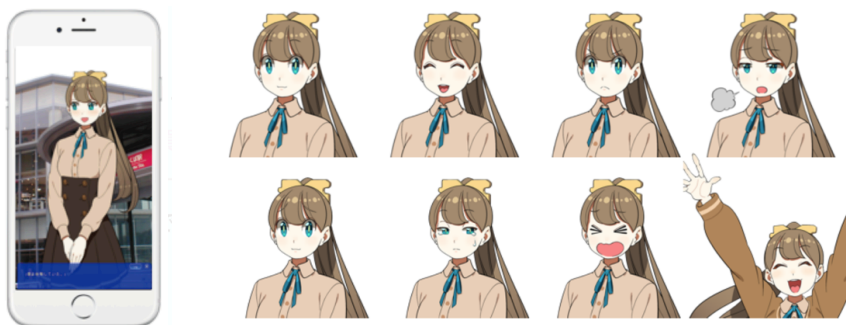
Fig. 1. Example of character expression

By using this front end character, the system renders a story and carries out dialogues with users. Three levels are set for the front end character depending on how engrossed a user becomes, and new stories develop as levels go up. Moreover, a character that resides on smartphones of users is used to accumulate knowledge about users, by continuously having dialogues with users. Users would convey their preferences through dialogues with the partner, as well as evaluating proposals from the character.