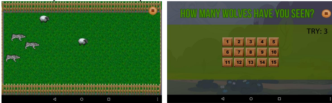
Fig. 1. The Counting Sheep Game Challenge and Response Interface.

Sheep and/or Wolves in the Enclosure; 2) Sheep and/or Wolves will be moving; 3) After one second, the player will have to answer with the number of Sheep and/or Wolves in the enclosure; 4) The player will be asked randomly about the number of Wolves; 5) In case the answer about the number of Wolves is not correct the player will not be penalized; 6) If the player provides a correct answer the difficulty level of the game will rise; 7) If the player gives a wrong answer, the difficulty level of the game will be reduced and the player can only miss two more times, i.e., the player will only be entitled to three attempts.