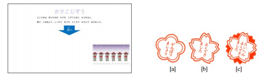
Fig 1:Record of oral reading practice1 Fig2:Record of oral reading practice2

The raising game function is created for the purpose of motivating children to practice reading aloud. They can raise a 'character' with their scores and the number of times they are evaluated. They can play with this character, going on adventures in response to the number of times they practiced.