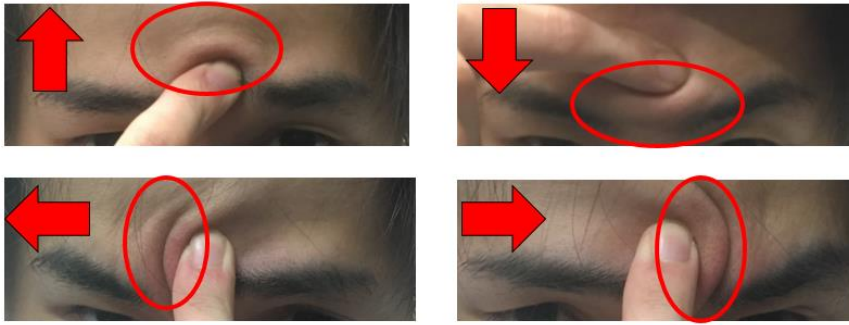
Fig. 1. The deformation of the skin on the forehead.

skin caused by the user touching forehead with the finger (Fig.1). Using the acquired sensor data, the directions of the touch on the forehead can be recognized. The sensors are attached to the HMD itself; therefore, additional controlling device is unnecessary. There are also research that utilize forehead skin deformation as an input [2], by moving the muscles of the eyebrows. Our research differs from this research as our method uses deformation of the skin caused by the touch of forehead with fingers.