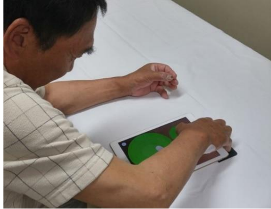
Fig. 2. Actual patient using app