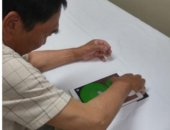
Fig. 2. Actual patient using app