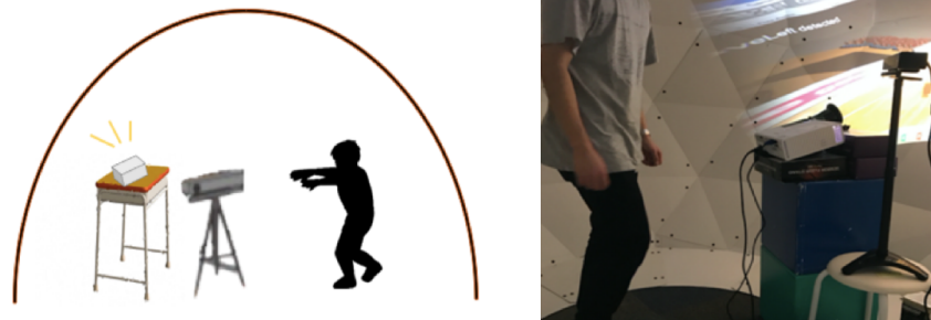
Fig. 1. Implementation environment: The inside and outside of the dome.