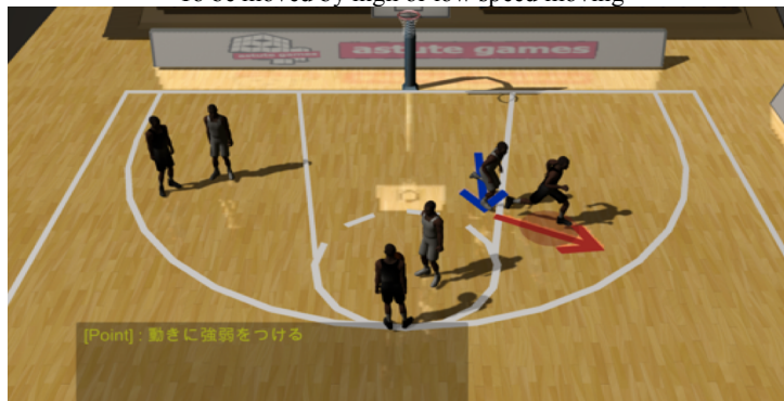
Fig. 2. Content of video from a third person viewpoint