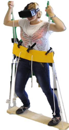
Fig. 1. Intermediate prototype from the iterative design process for a range of suspended setups for locomotion in VR.

This work contributes to the development of full-body interfaces for locomotion in VR with use cases in gaming and beyond. The publication of these late-breaking developments is meant to inform researchers and developers that may currently pursue similar challenges in the booming area of VR.