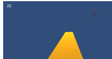
Fig. 2. Playful VR test application. Implemented in Unity3D.

Incoming rotation values are interpolated to avoid jitter in movements and mapped to the rotation around vertical or horizontal axis of the virtual board according to the physical manipulation of the real wooden board. The application allows for a forward, as well as for a sideways stance orientation. The system was used in conjunction with an Oculus DK2.