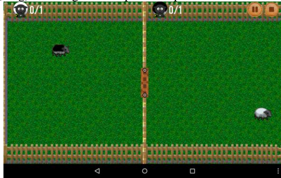
Fig. 1. Interface of Sorting Sheep.

Since a significant proportion of older subjects have mobility problems, this game was developed for mobile touch technology such as Tablets. Thus, the user can have access to this game in every place including hospitals, nursing homes or their own residence [12, 13]. In this game (Fig. 1) the objective is to separate all sheep according to their colour into the correspondent zone or field. Thus, black sheep should re-main in the right-hand side whereas white sheep must be kept in the left-hand side. To achieve this goal, the player should use a finger to open (touch) and move the Gate (drag) allowing the sheep to transpose the field to the correct side.