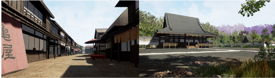
Fig. 3. Operation screen of proposed system, the left side shows the Former Tokaido Road, while the right side shows the precincts of the Shojoko-ji (Yugyo-ji) Temple.

elements, such as the Enoshima signpost, allegedly differed from the actual shapes of the past. Therefore, to assess these matters, we referenced old documents provided by the Fujisawa city archive. In the future, we will increase the accuracy of this system through comparisons with a variety of literature and user evaluations.