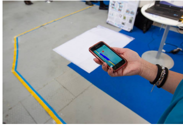
Fig. 1. The line captured by the phone

(see Fig. 1) and identifies the path by recognizing special colored strips painted or stuck on the floor. The users, then, receives a vibration signal through his cell phone. The vibration is related to the position and the direction of the user. In any installations of the system, the paths are marked with colored lines on the floor; QRcodes or beacon are also settled close to points of interest and they provide information on the right line to follow in order to get to the desired destination. The user interface employs tactile stimuli to receive feedback on the heading corrections to be employed, as better described in the following.