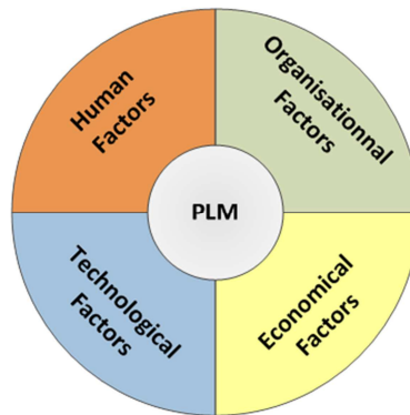
Fig.1. PLM axis structuration

questions to yield the information required. For these questions were conducted on the basis of indicators, words were reviewed by experts and finally we reorganised questions according to new 4 axes: Human Factors, Organisational Factors, Technical Factors and Economic Factors. This new decomposition does not affect the indicators but brings a fluidity and easier understanding for the interviewees (SMEs).