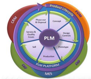
Figure 1. PLM Defining Elements