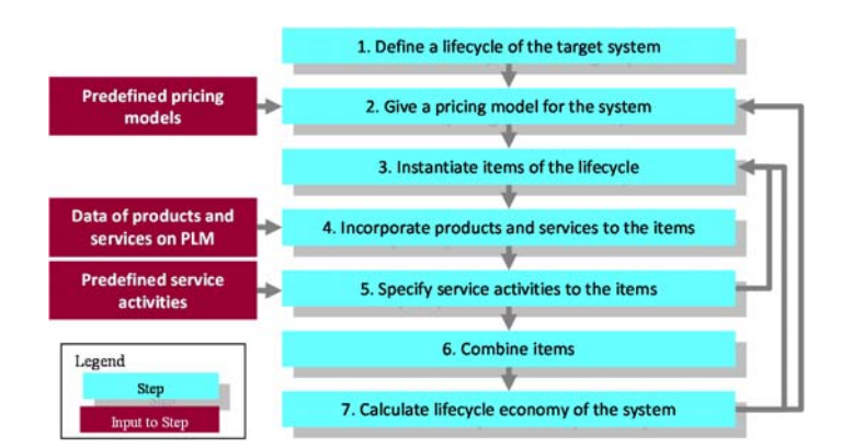
Fig. 1. Procedure with the proposed method

Step 1. Define a lifecycle of the target system – This definition includes the major function (functional unit in LCA), the length of the lifecycle and the boundary for the system to be designed and analysed.