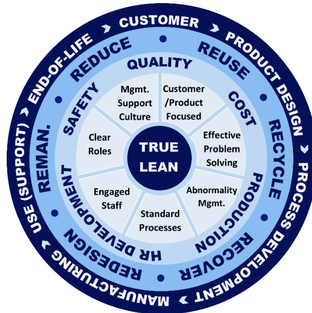
Fig. 3. Benevolent Production System model representing the integration between True Lean and Sustainable Manufacturing

The system is referred to as ‘ Benevolent ’ because it incorporates three basic criteria including: (1) the primary precepts of sustainability throughout the lifecycle, which strive to fully utilize existing resources with minimal impact on TBL; (2) it supports the highest customer satisfaction by promoting the production of quality products at lowest cost and on-time delivery; while (3) respecting society and the people who do the work. A benevolent production system therefore provides a win-win-win for the environment, economy and society (TBL).