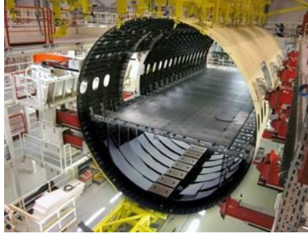
Fig. 2. Image of Airbus A350 XWB rear fuselage Section 16 at the assembly station

The Left Side Shell (LSS) have approximate 14 meters long and 5 meters of cord on the frontal frame, and it is positioned at the assembly station by 12 hoisting points, that can generate a rigid body translation and rotation to the part or that can be independently activated, moving each actuator at a time on a flexible movement. These hoisting points are the positioning control points of our problem definition, as shown on the figure 3. The requirement points are position characteristics, in the points of the part contour and along selected frames, and force characteristics, at the actuators location.