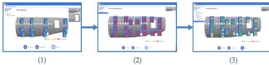
Fig. 4. FITFLEX software workflow

obtaining the rigid body move and flexible move that should be applied on the jig actuators to get a LSS position compliant to the requirements, shown on Figure 4 third image.