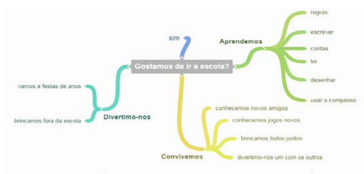
Fig. 3. Mental maps created by students during the opinion essay writing process using SRSD+ICT model, in Google