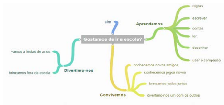
Fig. 3. Mental maps created by students during the opinion essay writing process using SRSD+ICT model, in Coogler