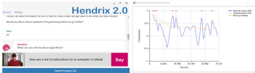
Fig. 1. Screenshot of Hendrix 2.0 chat interface (left) and real-time comprehension monitor (right)

Hendrix 2.0 structures conversational tutorial content by searching a graph of pre-defined subject knowledge which includes hierarchically structured concepts, definitions, examples, code samples, questions and more. During the conversation, Hendrix 2.0 will appraise the learner's understanding of the subject by asking the learner to explain concepts, answer questions or write basic programming code. Hendrix 2.0 can ask both simple questions requiring just a single word answer, for example 'true' or 'false', or complex questions requiring multiple words, phrases, mathematics or programming code.