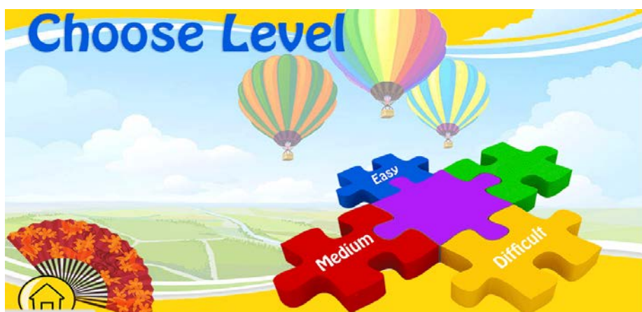
Fig. 1. Starting page of the game

The resulting application has a great amount of information on adolescent health through 200 questions, and the data presentation could further be tested and developed to be even more appropriate for the age group. The application works on a website where it can be tested, although it is still in need of technical fine-tuning. The game is a simple quiz-type of game with the possibility of choosing one of three difficulty levels. Players get points of each correct answer, which they have an option of sharing on Facebook [15]. This type of game allows knowledge testing, and as the correct answers can be expanded with an explanation, the player can also accumulate knowledge on individual topics. However, the learning effects were not tested yet, as the tool has only been used in usability testing situations.