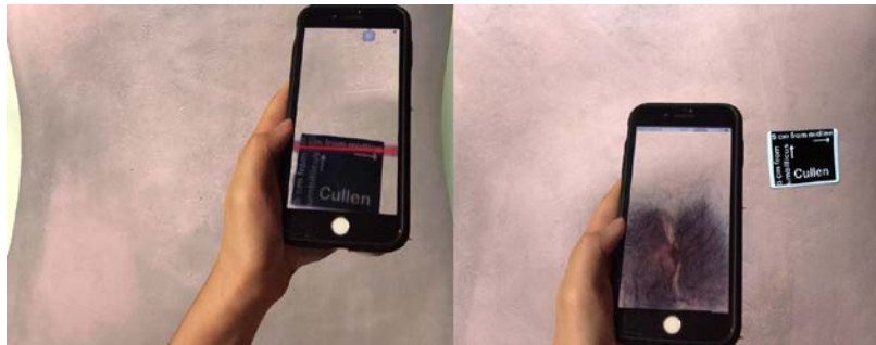
Fig. 1. Using CAROPE: LEFT: marker/trigger (black box) is scanned (red line). RIGHT: Cullen’s sign appears as an AR visual overlay on abdomen of a mannequin.

These markers are printed on stickers and adhered onto designated areas of the body to display these signs when scanned. Some are printed with information as to where and how it should be placed in relation to landmarks such as the umbilicus (belly button). For example, when the skin surrounding the umbilicus is augmented to display a bruise over it, the student can now describe it in detail during “Inspection” and would be expected to perform “Palpation” with care (Fig. 1).