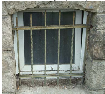
Fig. 3. A window protection with two types of bars

Challenge 3: At the wall there are several objects with the structure (0, 1, 0, 0, 1, 0). What is the purpose of these objects?