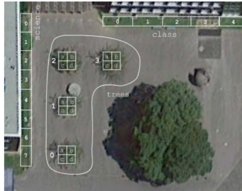
Fig. 8: URL-like Addresses of areas on a schoolyard

Challenge 9: Some areas on the schoolyard have identifiers that are explained in the satellite photo. In the area with the identifier science . 1 there is a small tree.