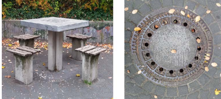
Fig. 2. Two different objects corresponding to the same metaphor

Another technique of abstraction in computer programming obviously is the use of a formal language for describing structures. The following task uses the Python notation of tuples to describe a sequence of objects: