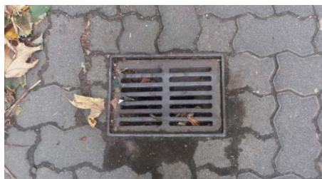
Fig. 7. A drain on the ground

Figure 7 shows the object that is expected to be found: a drain. The model is a nested tuple. Object B is a tuple containing two objects A, which consist of seven objects a each. Thus, the Smartwalkers are expected to draw an elongated hole.