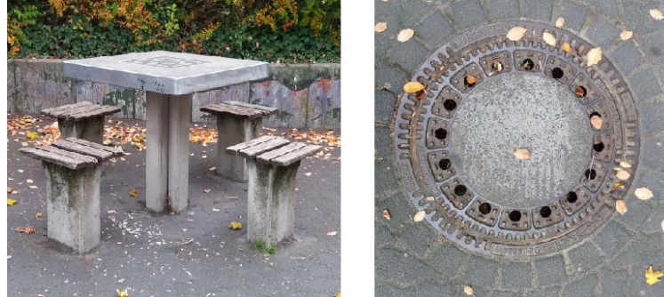
Fig. 2. Two different objects corresponding to the same metaphor

Another technique of abstraction in computer programming obviously is the use of a formal language for describing structures. The following task uses the Python notation of tuples to describe a sequence of objects: