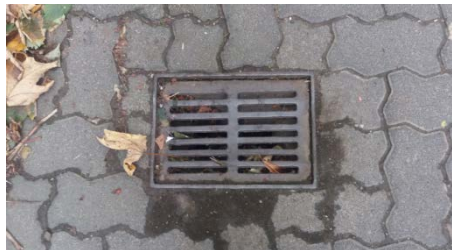
Fig. 7. A drain on the ground

Figure 7 shows the object that is expected to be found: a drain. The model is a nested tuple. Object B is a tuple containing two objects A, which consist of seven objects a each. Thus, the Smartwalkers are expected to draw an elongated hole.