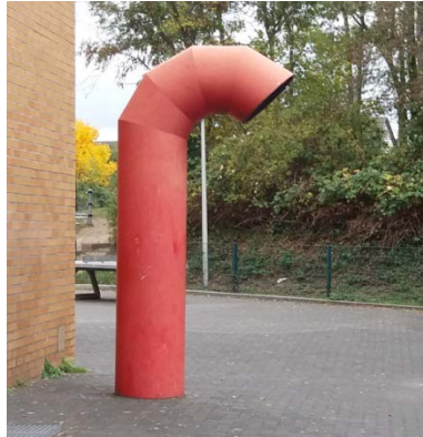
Fig. 4. Air ventilation pipe

Algorithms are an integral part of software that children use in their everyday life. The behaviour of a product as well as the ways how to use it is defined by algorithms. For example, a SnapChat message is not just a media but it has some kind of behaviour that is defined by an algorithm. It vanishes after some time. In challenge 11 the Smartwalkers create postings with a lifetime.