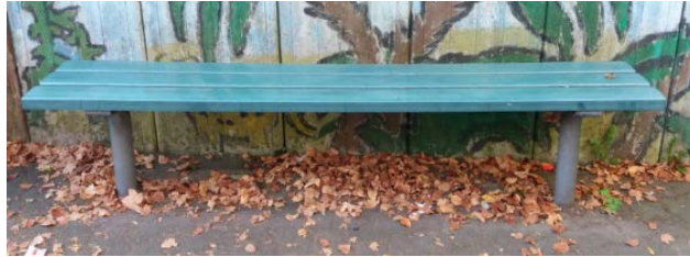
Fig. 6. A bench on the schoolyard

The following task is more abstract since it does not use meaningful names. On the other hand it is more explicit because it introduces names for the parts of the whole aggregate.