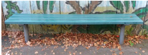
Fig. 6. A bench on the schoolyard

The following task is more abstract since it does not use meaningful names. On the other hand it is more explicit because it introduces names for the parts of the whole aggregate.