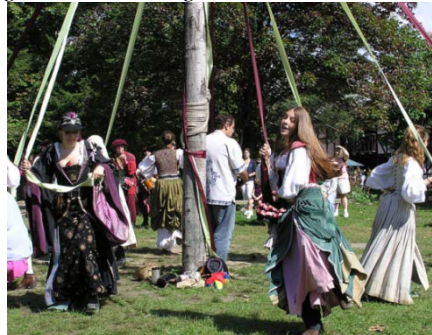
Fig. 1: Dancing around a maypole at a Renaissance faire in Tuxedo Park

Challenge 7: Find a thing, which is similar to the image.