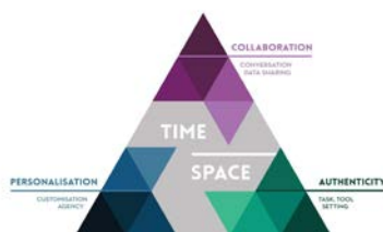
Figure 1. The Mobile Pedagogical Framework (iPAC) comprising three distinctive features of mobile learning experiences. Adapted from ([13], p.8)

The personalisation construct consists of the sub-constructs of 'agency' and 'customisation'. High levels of personalisation would mean the learner is able to enjoy an enhanced degree of agency [25] and the flexibility to tailor both tools and activities, interacting with a strong sense of ownership of both the device and the learning process. The authenticity construct privileges opportunities for in-situ, participatory learning [26]. The sub-constructs of 'task', 'tool' and 'setting' focus on learners' involvement in rich, contextualised tasks, making use of tools in a realistic way, and driven by relevant real-life practices and processes [27]. The collaboration construct captures the conversational, networked features of m-learning. It consists of 'conversation' and 'data sharing' sub-constructs, as learners engage in negotiated meaning-making, forging connections and interactions with peers, experts and the environment [28]. This iPAC framework provides a useful lens to analyse mobile apps and how use of their features might leverage mobile pedagogies in a range of learning environments.