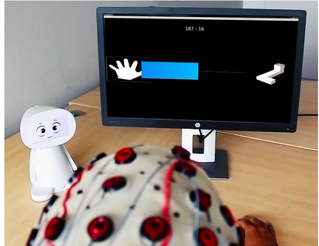
Figure 3: Experimental setting where PEANUT (on the left) provides a user with social presence and emotional support adapted to his performance and progression [63].

Map to recognize an emotion from the user's facial expression, and learn to express the same [12]. The model allows the robot to adapt to a different user by associating the perceived emotion with an appropriate expression which makes the companion more socially acceptable in the environment in which it operates.