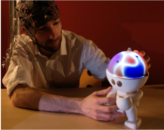
Figure 2: User visualizing his brain activity using Teegi [18].

Other studies investigated new ways of providing some task specific and more tangible feedback. In [18] and [52], the authors created tools using augmented reality to display the user’s EEG activity on the head of a tangible humanoid called Teegi (see Figure 2), and superimposed on the reflection of the user, respectively.