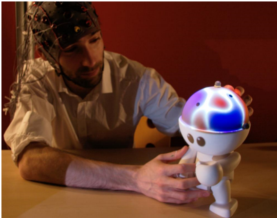
Figure 2: User visualizing his brain activity using Teegi [18].

Other studies investigated new ways of providing some task specific and more tangible feedback. In [18] and [52], the authors created tools using augmented reality to display the user’s EEG activity on the head of a tangible humanoid called Teegi (see Figure 2), and superimposed on the reflection of the user, respectively.