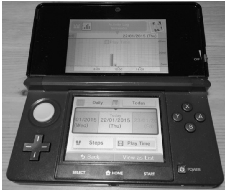
Figure 3. Daily view of activity log events.

Internet Settings, the new menu contains the items: Connection Settings, SpotPass, Nintendo DS Connections, Other Information.