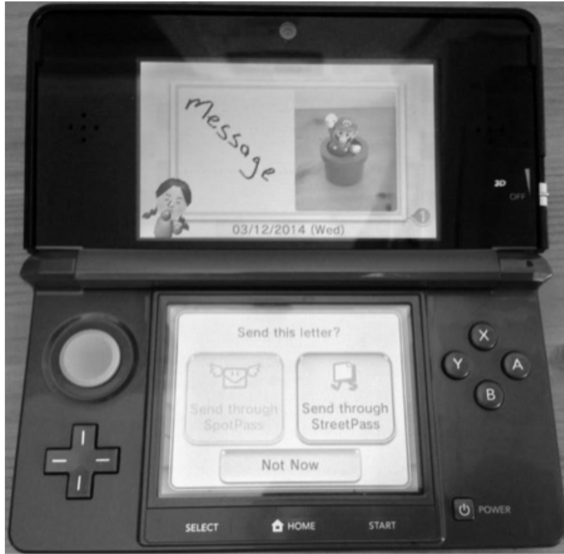
Figure 1. StreetPass service for exchanging pictures and messages.

3DS, a number of applications and game titles have been shown to be exploitable. A comprehensive list can be found in [24]. Several FTP homebrew applications have also been released [2], but at the time of this writing, they only allow access to the miniSD card, not the internal NAND flash memory.