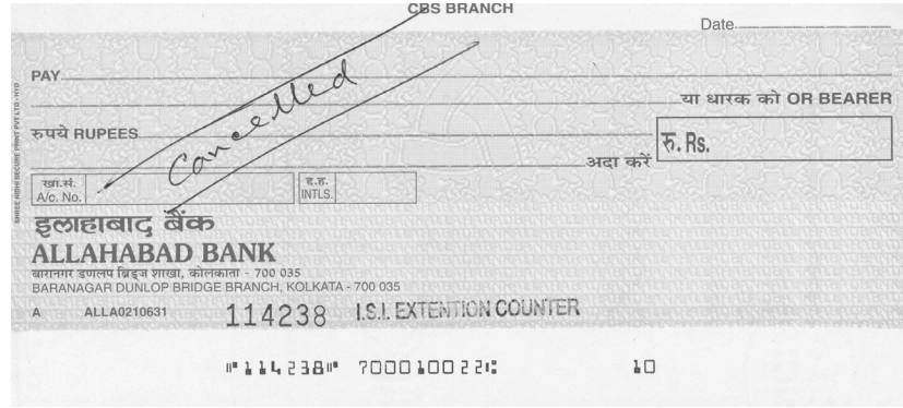
Figure 2. Original check.